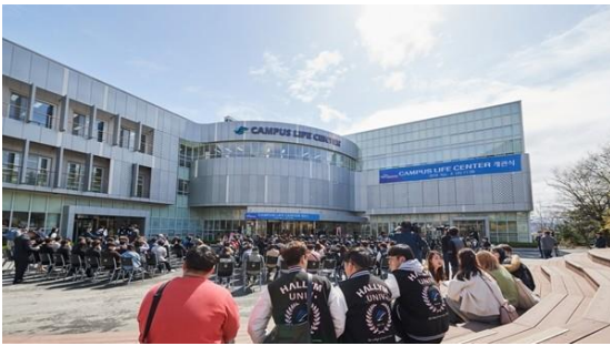
Campus Life Center (CLC)