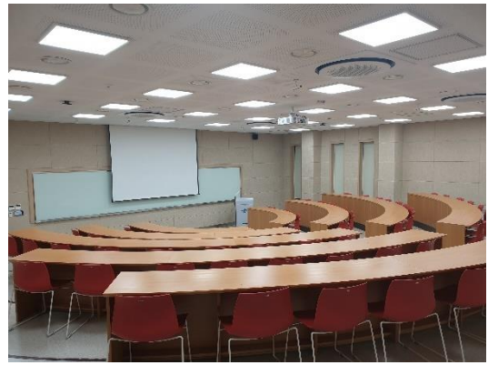
Lecture Room (2)