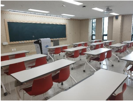
Lecture Room (1)