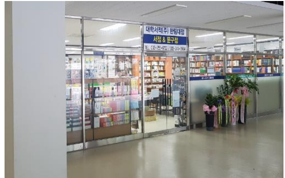
Stationery Store (in CLC)