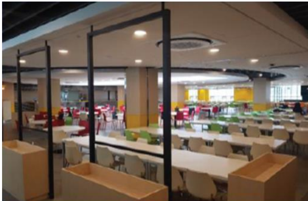
Cafeteria (in CLC)