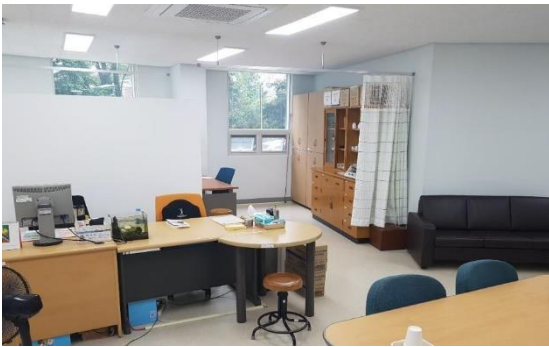
Health Clinic (in CLC)