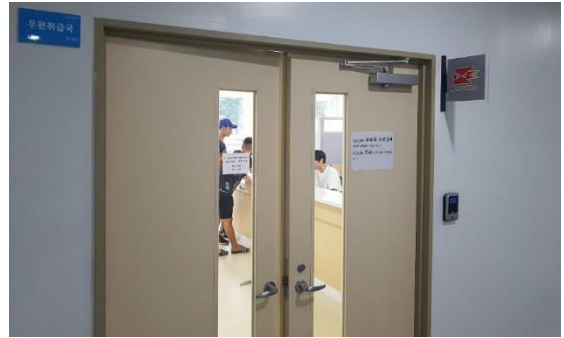
Post office (in CLC)