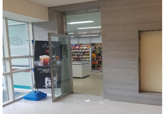
Convenient Store (in CLC)