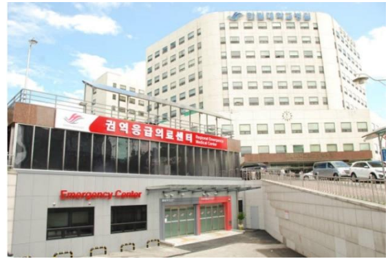
Hospital (Hallym University Hospital)