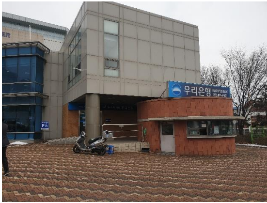
Bank (Woori Bank)